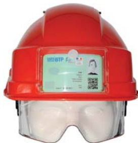
IRIS 2 badge holder version