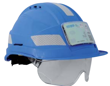
KARA with options: goggles, rigid badge holder and retro-reflective stickers