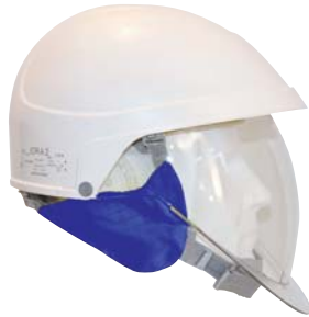
IDRA 2 helmet with 4-point chinstrap and hearing protection